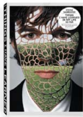
SAGMEISTER'S NEW BOOK